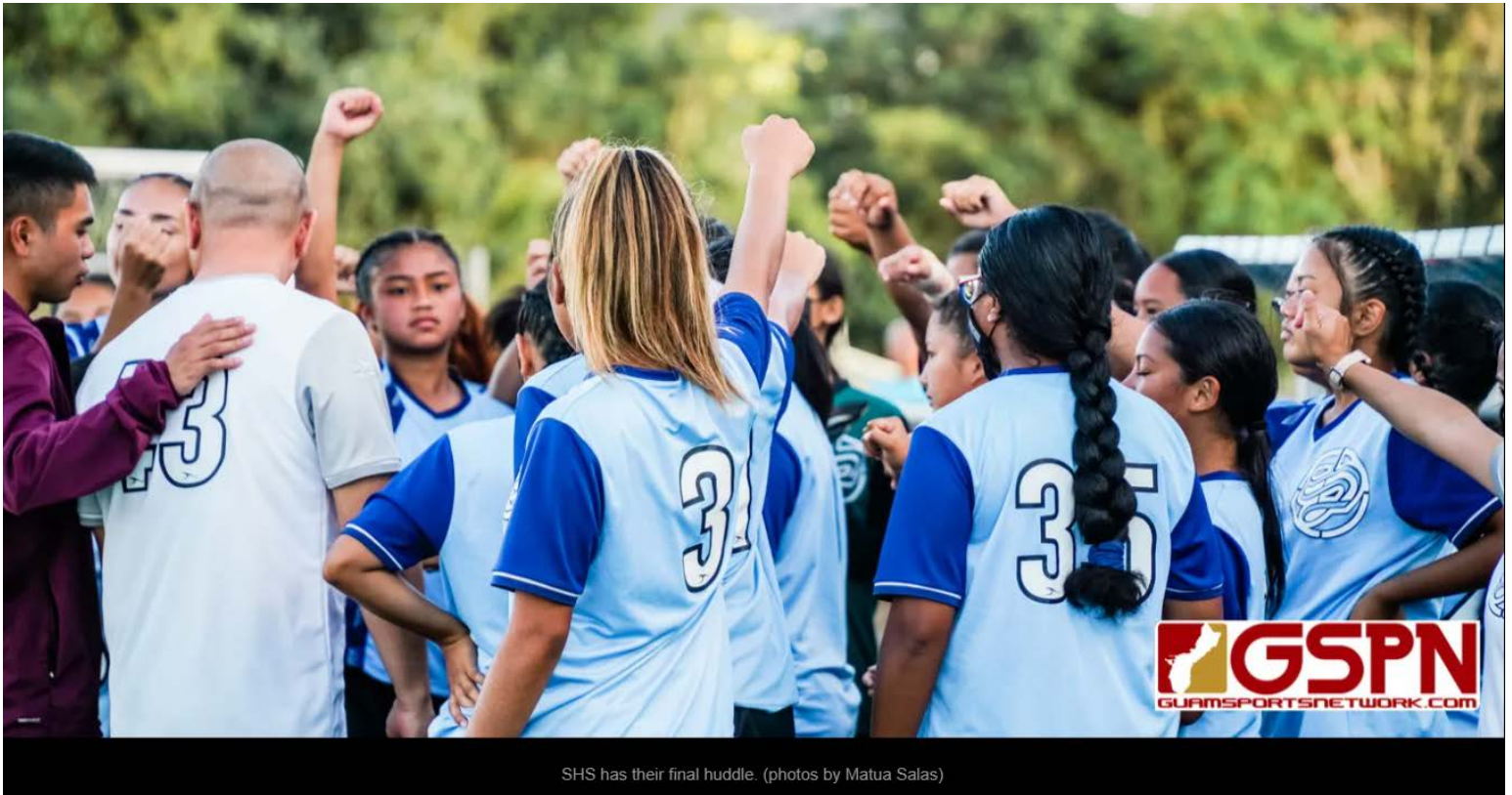
SHS has their final huddle.