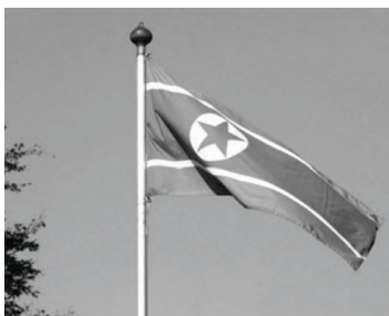
FLAG: A North Korean flag flies on a mast at the Permanent Mission of North Korea in Geneva Oct. 2, 2014.

"The test-fire was aimed to selectively evaluate tactical guided missiles being produced and deployed and