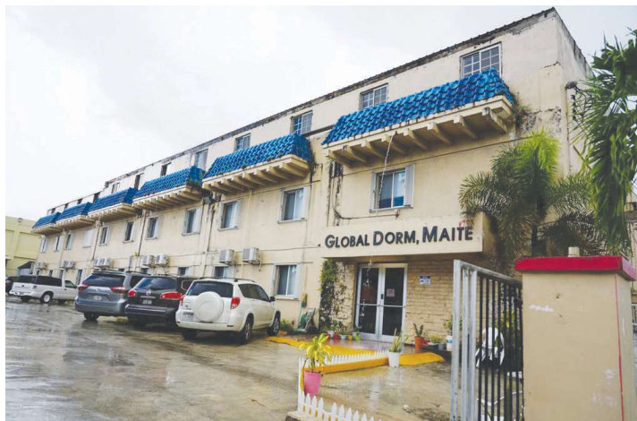
'FIRST EFFORT': Adelup has announced that "more than 30 unsheltered homeless individuals" have been given shelter at Global Dorm Maite, pictured here on Monday, July 13.